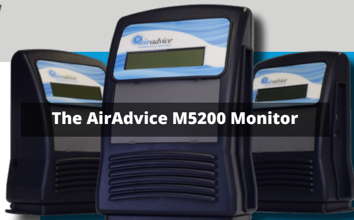
The AirAdvice M5200 Monitor