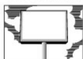
DOUBLE FACE CENTER POLE