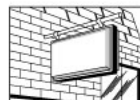
DOUBLE FACE SWING MOUNT