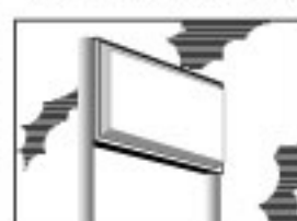
DOUBLE FACE BETWEEN POLE